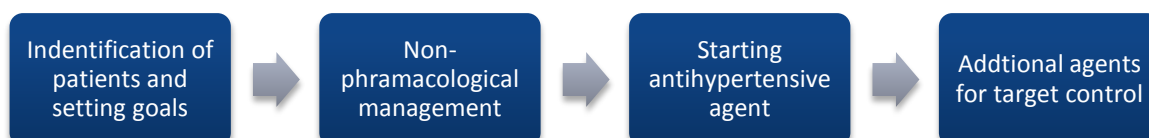
Fig 2 Steps in the management of hypertension in patients with diabetes and CKD stages 4 and 5

Continued monitoring of blood pressure, drug compliance / side effects, electrolytes, kidney function and albuminuria