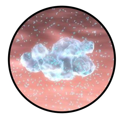
Microsphere degradation and continued release of exenatide<sup>1</sup>