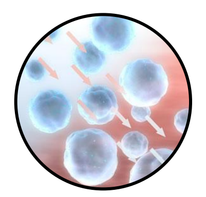
Subcutaneous injection of microsphere suspension of exenatide<sup>1</sup>