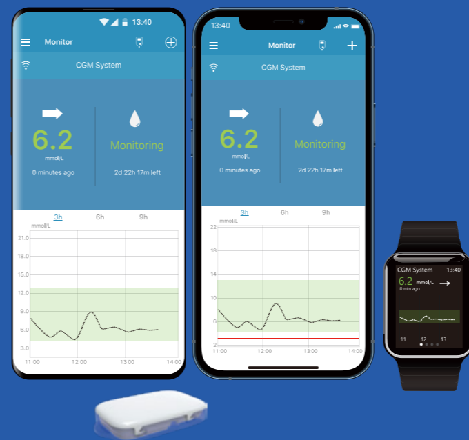
EasySense App (iOS & Android)