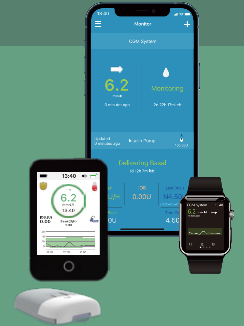
EasyTouch App (iOS & Android)